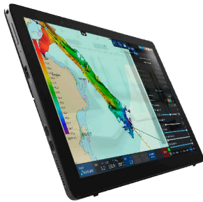
Vehicle Control Station