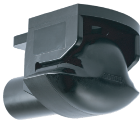
Bathymetric Mapping System